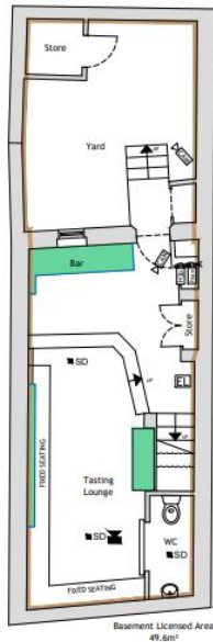
-01 Basement Plan